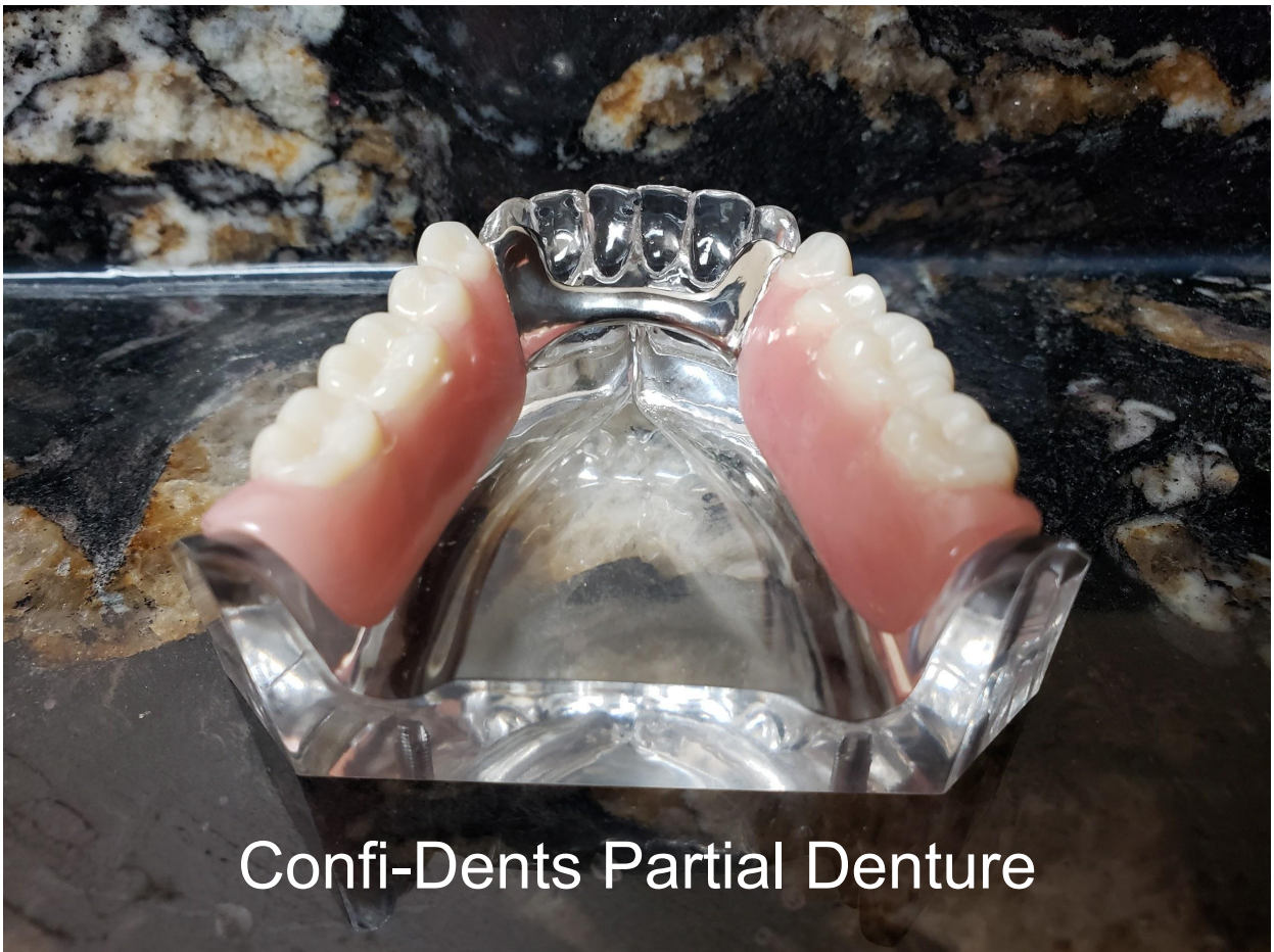
Confi-Dents Partial Denture

They are supported by dental implants and are removable.